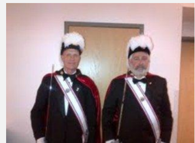
Fourth Degree Knights:

And finally, there is the Adoration of the Blessed Sacrament by the people during the night, just as the disciples stayed with our Lord during His agony on the Mount of Olives. Again, our Fourth Degree Honor Guard kept watch, standing at attention during the adoration period.