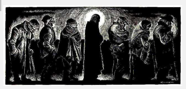
Jesus in the Bread Line

The next Community project is the highway cleanup currently scheduled for May 18<sup>th</sup>. Watch this space for more details.