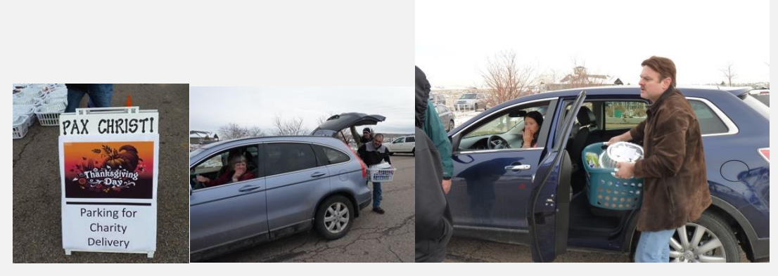
Here's the most important part of the program – delivery. Parishioners loaded up cars and trucks to deliver the baskets to local charities.

Parishioners who had pledged to make baskets dropped them off in front of the Church.