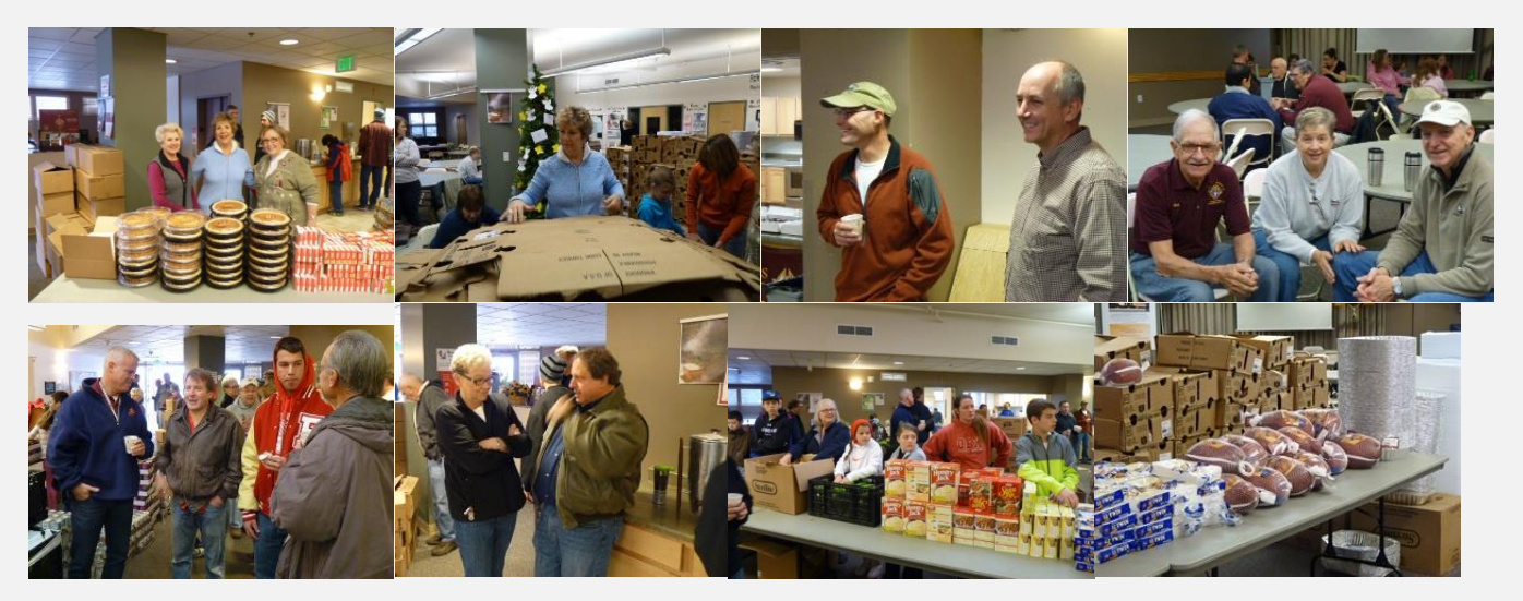
Over 100 volunteers put the baskets together in 27 minutes.