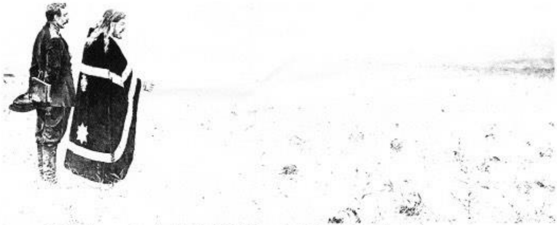
Image: Orthodox service for the Faithful Departed. Vasily Vereshchagin.