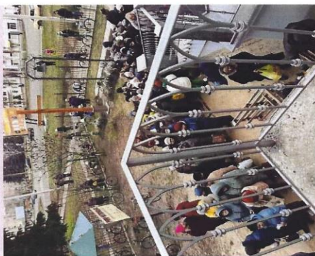
CONU support provides meals and supplies for displaced refugees at Ukrainian churches.