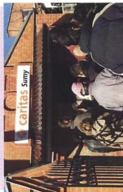
Soup kitchens and clinics are in dire need during this time throughout Ukraine.