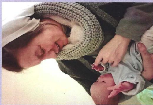
Love abounds at the Single Mothers Home, also known as the House of Hope.