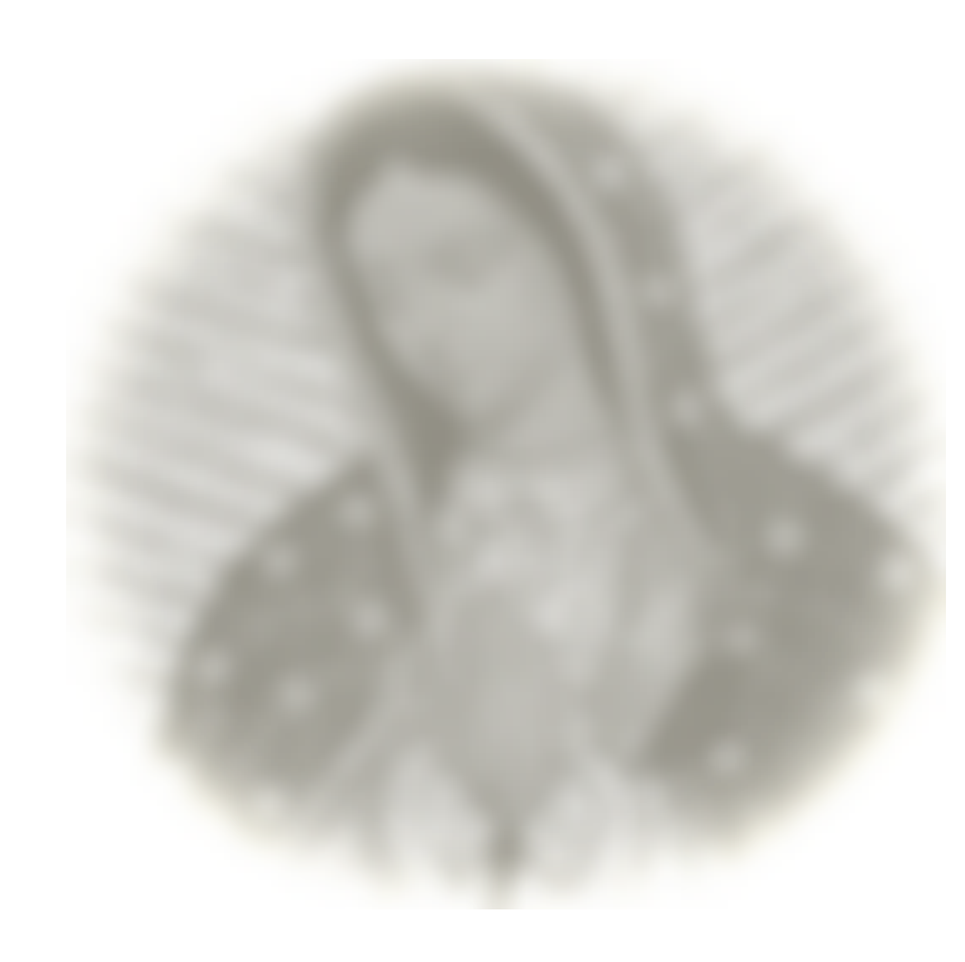
Image: A mosaic of Our Lady of Guadalupe decorates a side altar in the Church of Santa Maria della Famiglia at the Vatican. Dec. 15. Evangelium vitae (The Gospel of Life), no.77 © 1995, Libreria Editrice Vaticana. Used with permission. All rights reserved. Models used for illustrative purposes only. Copyright © 2021, USCCB, Washington, DC. All rights reserved.

Watching the news and reading headlines, we may often feel helpless in the face of heartbreaking lack of respect for human life. When our efforts to make a difference feel small, it's important to remember that changing the culture is a process of conversion that begins in our own hearts. It includes a willingness to be instructed by the Holy Spirit and a desire to be close to Jesus—the source of joy and love. How to Build a Culture of Life briefly explains where to start.