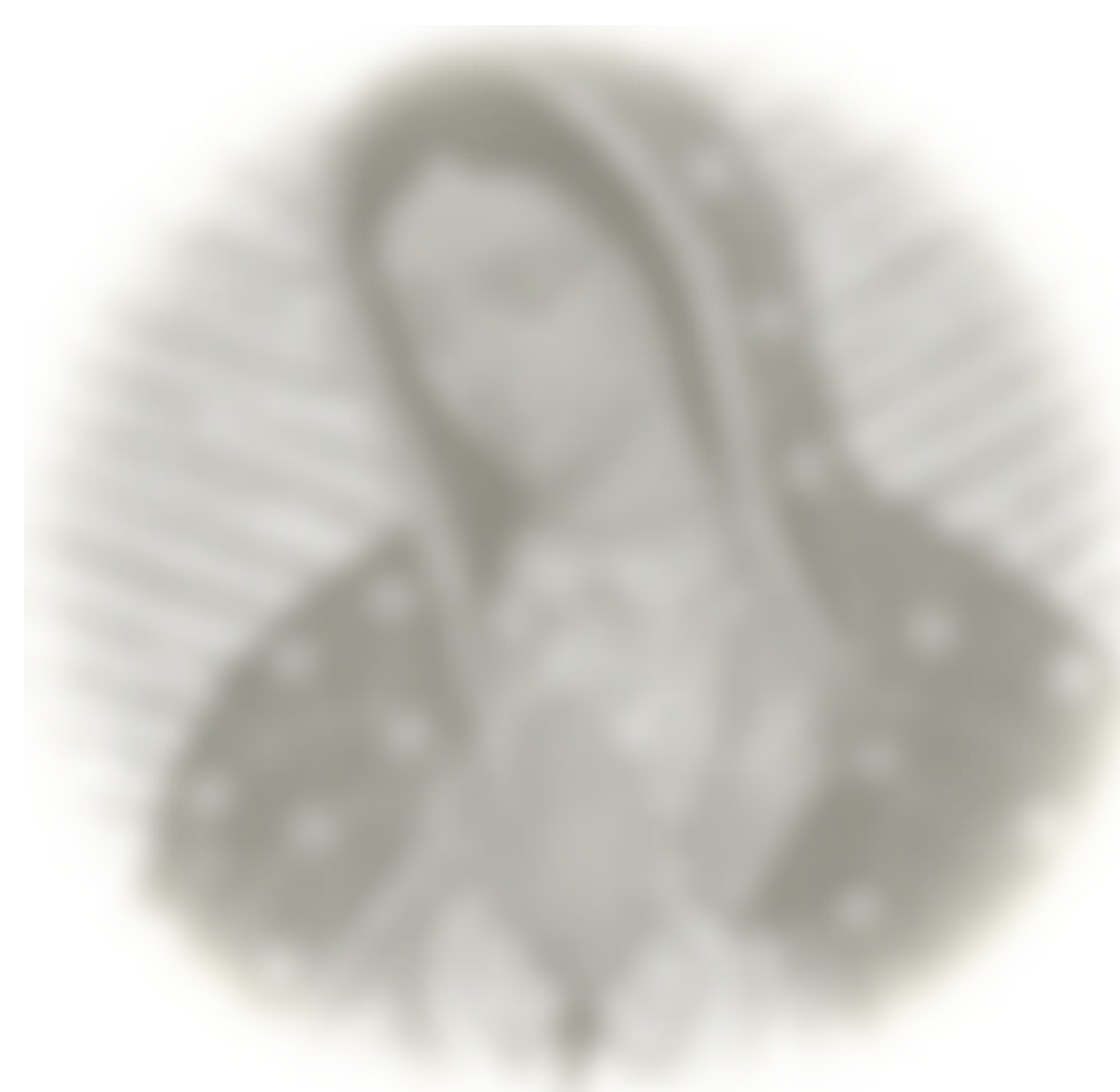
Image: A mosaic of Our Lady of Guadalupe decorates a side altar in the Church of Santa Maria della Famiglia at the Vatican. Dec. 15. Evangelium vitae ( The Gospel of Life), nos. 8-9 © 1995, Libreria Editrice Vaticana. Used with permission. All rights reserved. Copyright © 2021, USCCB, Washington, DC. All rights reserved.

Evangelium vitae ( The Gospel of Life ) was written to reaffirm the value and inviolability of every human life and to appeal to all people to respect, protect, love, and serve every human life. A brief summary highlights key themes and foundational teachings from the papal encyclical, exploring how the Church's teachings regarding human life are at the heart of Jesus' entire Gospel message.