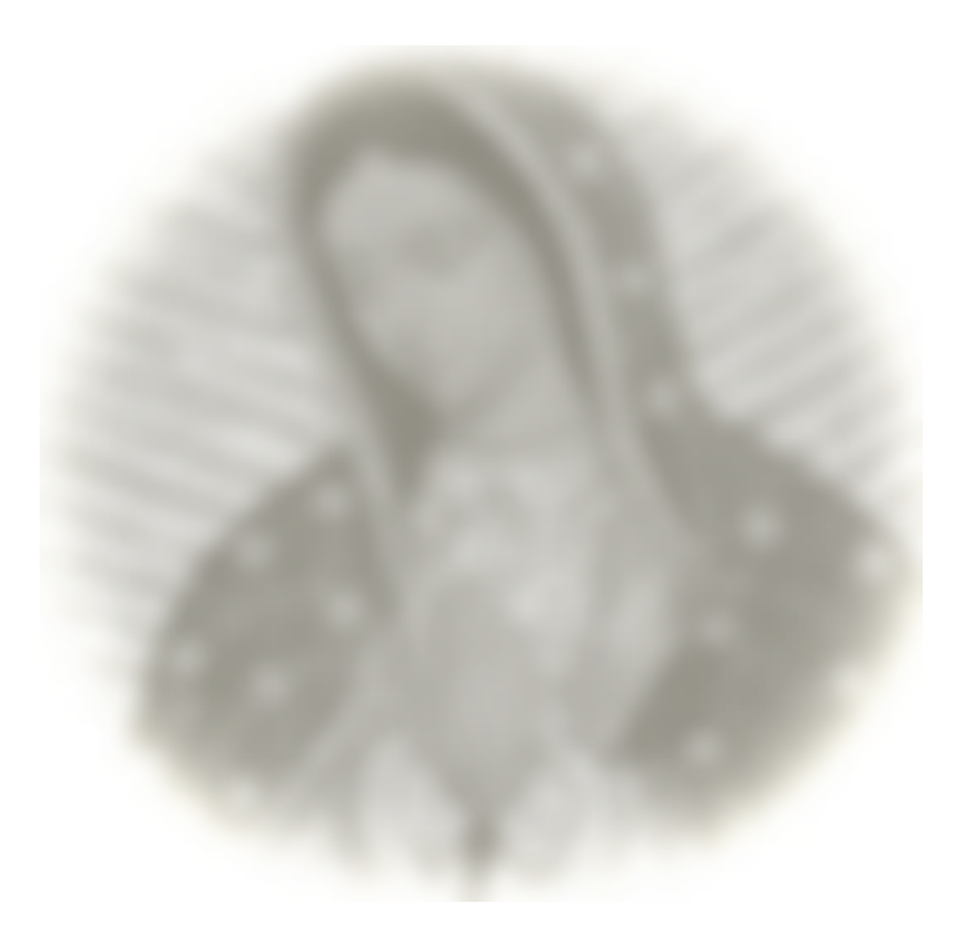
Image: A mosaic of Our Lady of Guadalupe decorates a side altar in the Church of Santa Maria della Famiglia at the Vatican. Dec. 15. NABRE © 2010 CCD. Used with permission. Models used for illustrative purposes only. All rights reserved. Copyright © 2021, USCCB, Washington, D.C. All rights reserved.

When a woman is facing an unexpected pregnancy, the reaction of the first person she tells tends to set the tone for her decisionmaking. Pregnancy can be difficult and frightening, but no matter the circumstances, it's important for an expectant mother to feel supported and loved. Read <u>10 Ways to Support</u> <u>Her When She's Unexpectedly Expecting</u> for simple tips on how to provide loving, lifeaffirming support for a friend who is unexpectedly pregnant. Your support may be the only support she receives.